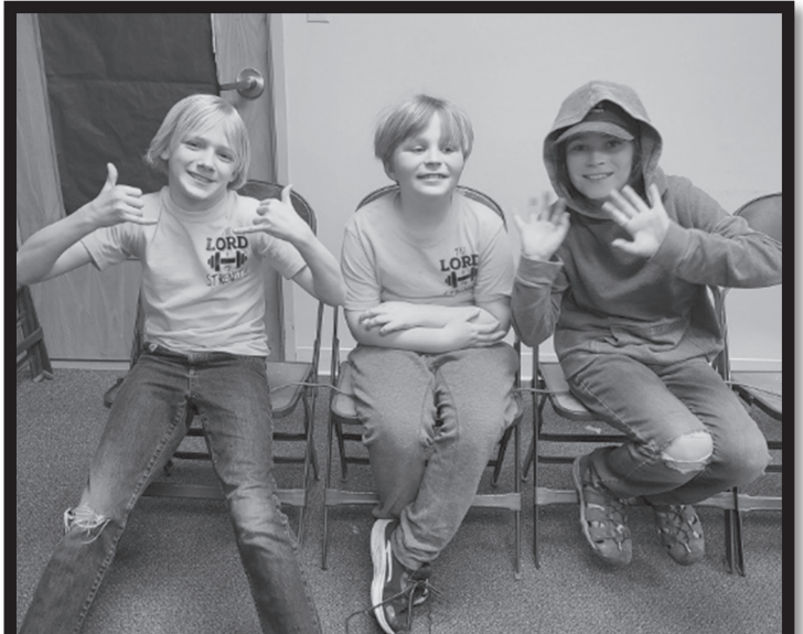
Trier Ridge Community Church, Bible Quizzers

Mostly, I enjoyed being part of a team. We had a pretty tight group. We weren't that good, but we always had fun. I remember traveling to a western PA