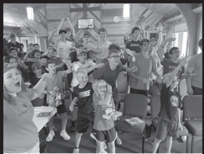
Bible Quizzers celebrate at Quiz Finals 2024

something new about Jesus. The Helper whom Jesus sent to the disciples back then (and had been the One tugging that July evening) provided the same help to me now. My devotions and prayers went from obligatory because I had been told I should, to sitting, reading, and talking with a parental friend who knew me better than I knew myself.